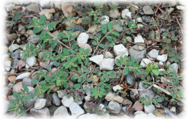
Pesky Spurge Weed

It is overwhelming for just a few people to keep pulling out the weeds, so an idea has been floating around in multiple committees: “WHY NOT HAVE A WEEDING FELLOWSHIP ONCE OR TWICE A MONTH?” If enough volunteers get on board, we could divide the beds into small sections, which would allow the beds to be cleaned in a short amount of time – refreshments afterwards.