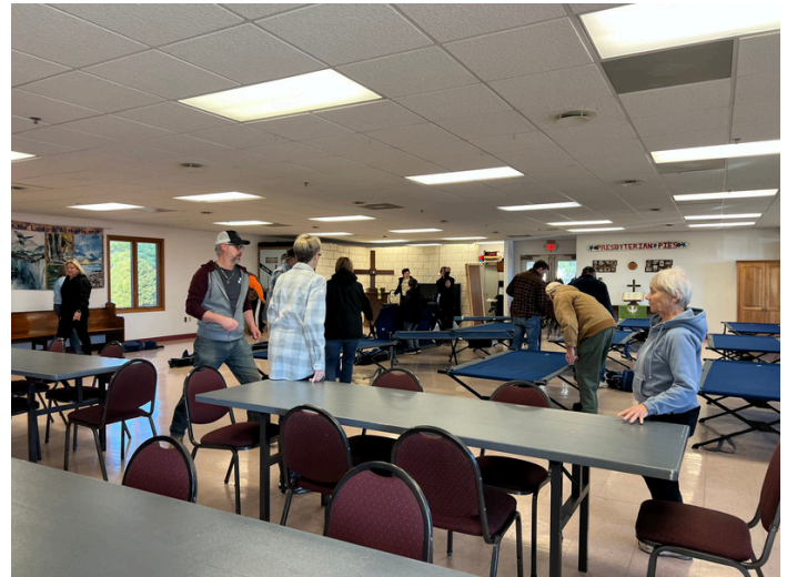
Prepping to host the OWL in Feb 2026

Recognizing this falls squarely into our Matthew 25 mandate, our Session has been discerning this possibility. Part of that discernment is yours. The Session wants to hear your questions and receive your input before moving forward.