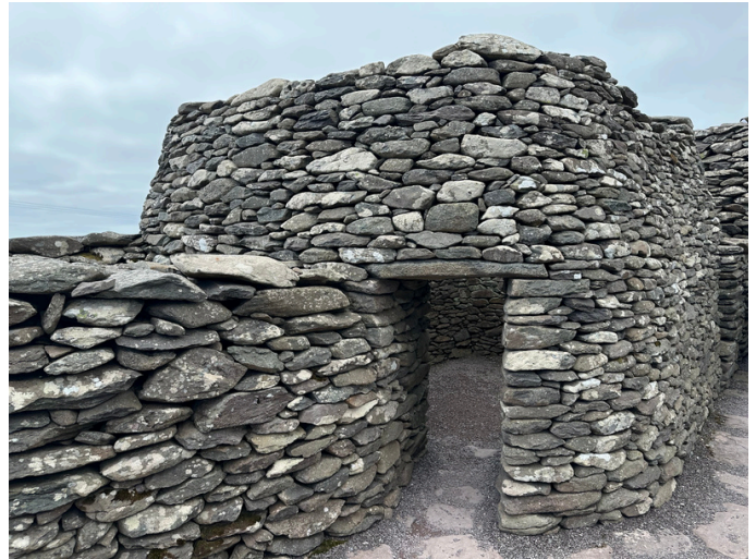
The "Beehive" structures on Dingle Peninsula, Ireland

Those old structures reminded me of the passage we read from 1 Peter on the last Sunday in April: "Come to Jesus, a living stone, though rejected by mortals yet chosen and precious in God's sight, and like living stones let yourselves be built into a spiritual house, to be a holy