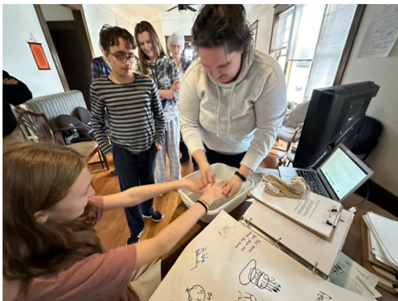
One of our youth washes the hands of her confirmation mentor.